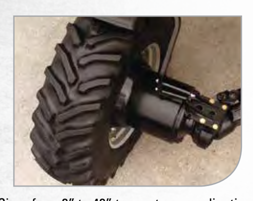
Sizes from 2" to 42" to meet any application.